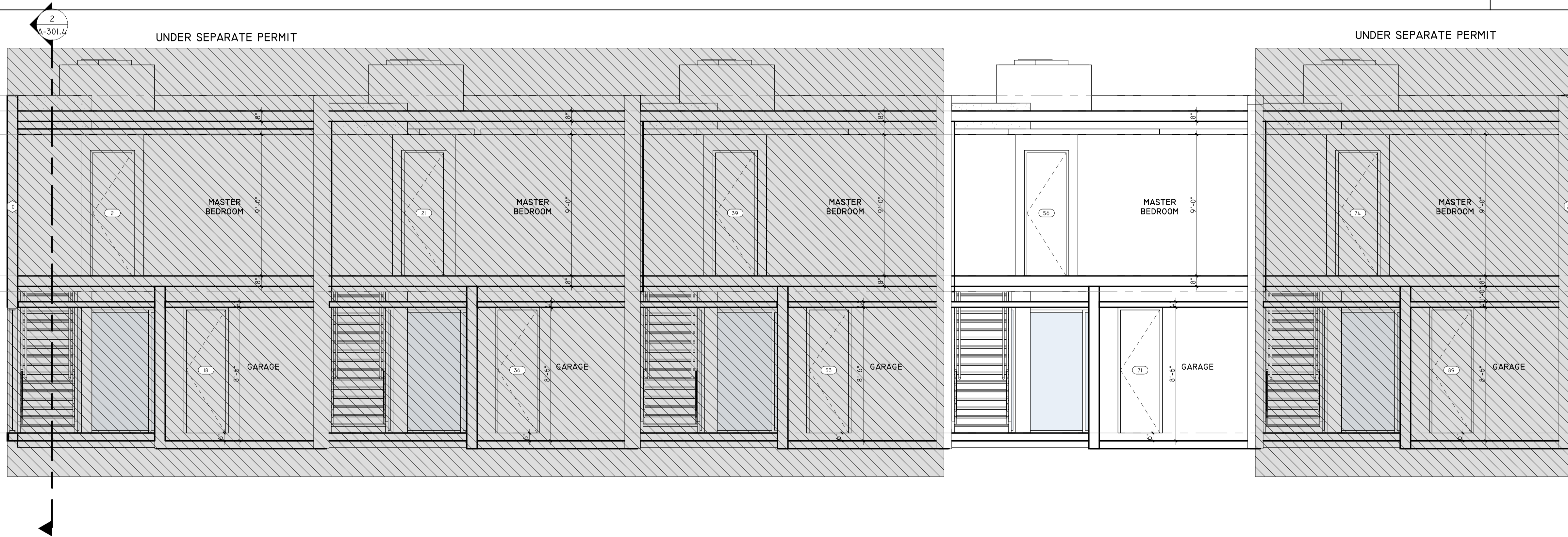
SECTION B 1/4" = 1'-0"